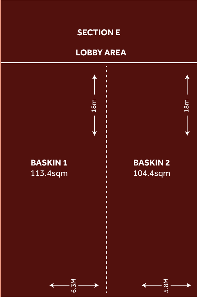
FULL BASKIN SUITE 241sqm - 18m X 13.4m

CONTACT OUR DEDICATED MEETINGS & EVENTS TEAM